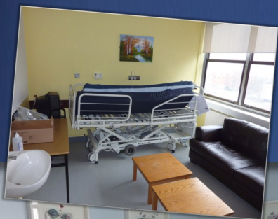
St Anne's Before and After