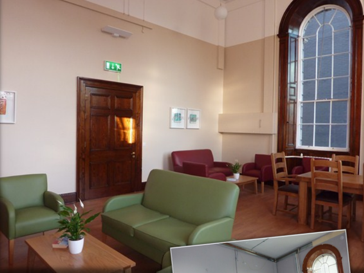
Dialysis Before and After