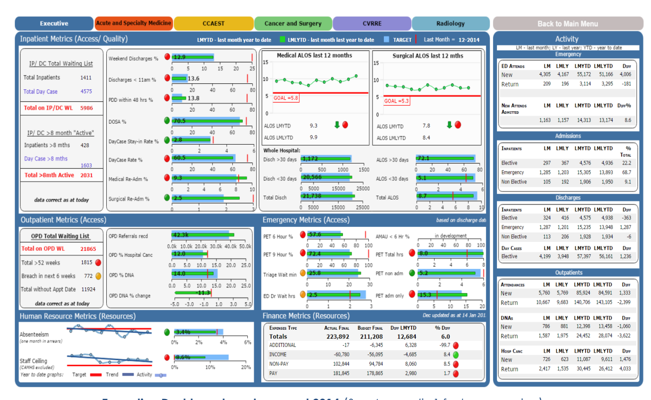
Executive Dashboard as at yearend 2014 (See Appendix 1 for larger version)

We have an excellent track record regarding outcomes in many of our specialist clinical areas, in particular our Cardiovascular, Intensive Care, Transplant, Spinal and Cancer Services.