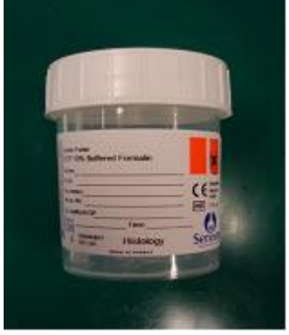
10% buffered Formalin - large