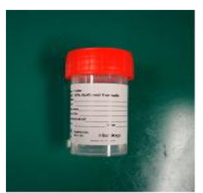
10% buffered Formalin - small